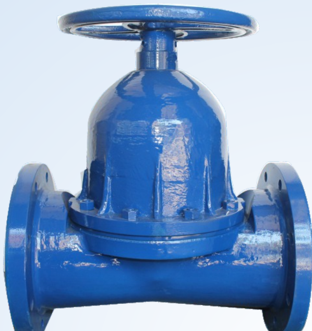
FIG 7520FFFSRL Flanged Diaphragm Valve CI Soft Rubber Lined , Full Flow